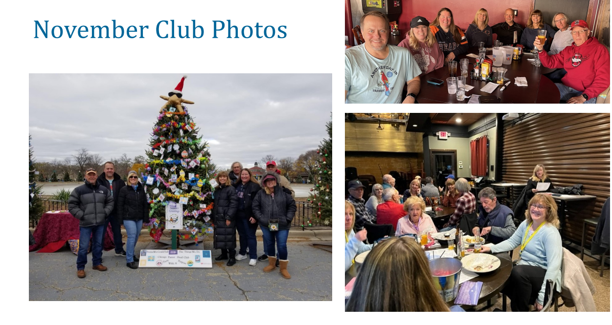
"Wrinkles will only go where the smiles have been." - Jimmy Buffett, Barefoot Children in the Rain, from the album "Barometer Soup"