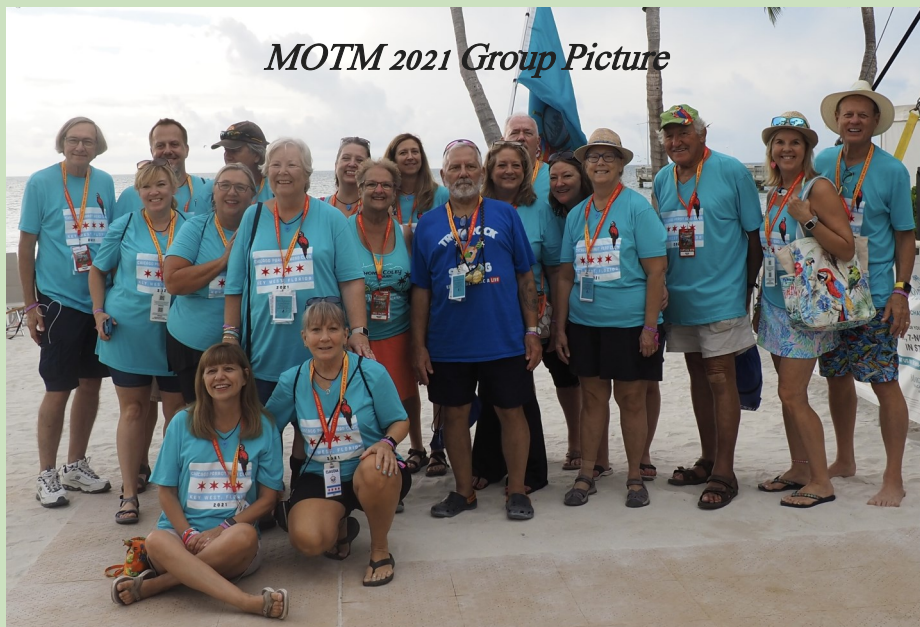
MOTM 2021 Group Picture

https://offer.fevo.com/chicago-wolves-vs-tbd-sspeis3-20ffbde?fevoUri=chicago-wolves-vs-tbd-sspeis3-20ffbde%2F