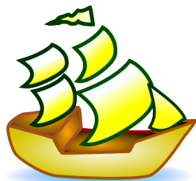
The Breezy Edition