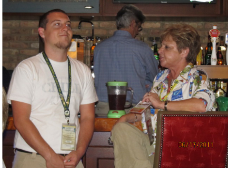
Frozen concoctions? Yes!