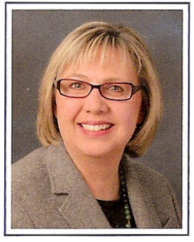
Owned And Operated By NRT LLC.

7000 S Harlem Ave Bridgeview, IL 60455 708-594-7200