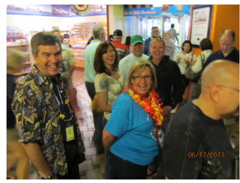
Parrot Heads line up to enter