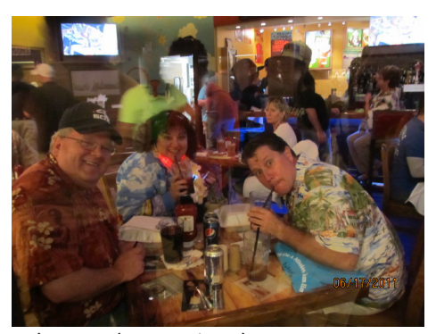
Who needs a cocktail?