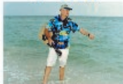
Food and Drink Specials

Featuring the music of FLIP FLOP DAVE 8 - 11 PM