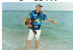
Food and Drink Specials

Featuring the music of FLIP FLOP DAVE 8 - 11 PM